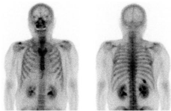
Figure 2. Bone scan revealed multiple rib metastases in both sides.

Herein, we report a 32-month responder with lung adenocarcinoma harboring double uncommon EGFR L861Q and G719X mutations, who was treated with afatinib therapy. The clinical activity of afatinib in NSCLC patients with uncommon EGFR mutations has been confirmed in clinical trials (3). This study was a combined post-hoc analysis of three clinical trials, LUX-Lung 2, LUX-Lung 3, and LUX-Lung 6, in patients with advanced NSCLC harboring uncommon EGFR mutations (3). In the analysis, 75 (12%) of 600 patients, who were treated with afatinib, had uncommon EGFR mutations (3). Median progression-free survival of the three uncommon mutation groups: point mutations or duplications in exons 18-21, de novo Thr790Met mutations in exon 20 alone or in combination with other mutations, or exon 20 insertions, was 10.7, 2.9, and 2.7 months, respectively. Median overall survival was 19.4, 14.9, and 9.2 months, respectively (3). It is well known that there are many types of uncommon mutations (3-14). In addition, the existence of patients with multiple uncommon mutations has been clarified (3-14). Since the number of patients with each uncommon mutation type is small and there are many types of uncommon mutations at the gene level, it is difficult to clarify the PFS and OS of each type of