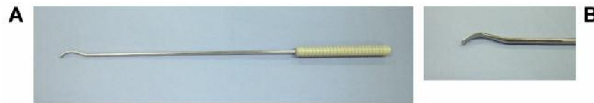
Figure 1. Slender tracheal forceps made at our institution. A: Complete view of the forceps. B: Magnified view of the head of the forceps. The obtuse angle allows gentle exclusion and traction of the trachea. This is appropriate as an artery or nerve exclusion forceps.

classification (12), and complications greater than grade II were regarded as significant. Surgical mortality (Clavien–Dindo grade V) included in-hospital deaths (by postoperative day 90).