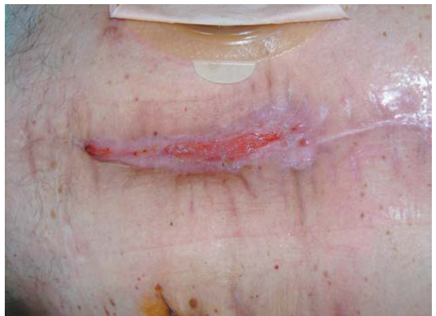
Figure 4. The fistula was almost completely healed at the time of discharging the patient.

blood was immediately centrifuged to obtain packed red blood cells (PRBCs) and PRP. PRBCs were reinfused to the patient. PRP was centrifuged to obtain platelet-poor plasma (PPP) and platelet-concentrate (PC). PPP was immediately frozen at -80^{\circ}\text{C} in a deep freeze refrigerator; then the frozen plasma (FFP) was left at 4^{\circ}\text{C} for 18 h for spontaneous thawing. Cryodepleted plasma was removed and the residual cryoprecipitate was dissolved in 30 ml of plasma. PC was conserved at 22^{\circ}\text{C} with continuous agitation.