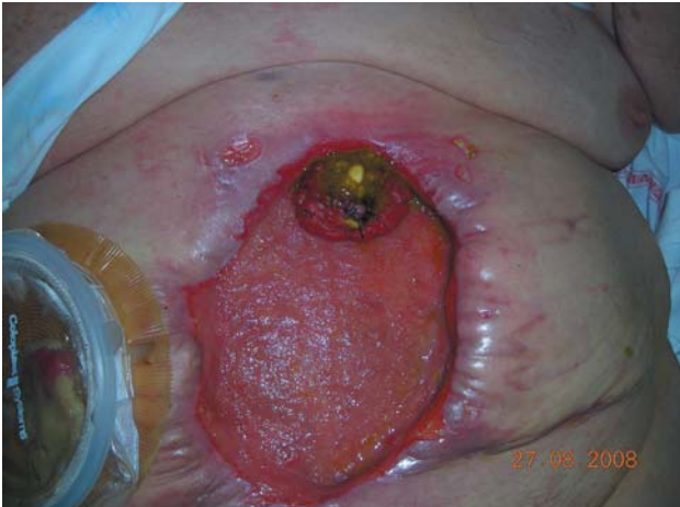
Figure 1. Patient presented a high-volume enterocutaneous fistula associated to a large loss of substance in the abdominal region.