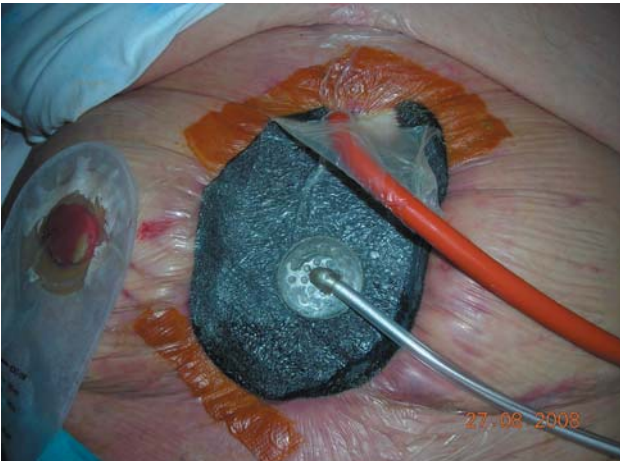
Figure 2. The VAC system was applied to the whole area of the fistula in order to drain the contaminating materials and promote the development of granulation tissue.