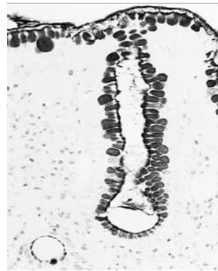
Figure 3. Detail, showing sialomucin-positive goblet cell in the glandulo-metaplastic esophageal mucosa (H&E, Barrett's esophagus, \times 40 , baboon).

cystatin C-positive, strongly eosinophilic material found in the cytoplasm of human duodenal cells (11). Hence, despite the fact that GGCs can easily be recognized in H&E-stained sections, the histochemical and/or immunohistochemical nature of the glassy material remains unidentified. It is, however, apparent that the proteinaceous glassy material secreted by the Golgi organelle is, for unknown reason(s), retained in the cytoplasm of these cells. In this respect, Kopito and Sitia (12) claim that all cells are equipped with a proteolytic apparatus that eliminates misfolded and damaged proteins. The 26S proteasome, the principal engine of cytoplasmic proteolysis, requires unfolded substrates but is ineffective at degrading aggregated proteins. When the production of aggregated proteins exceeds the cell capacity to eliminate them, a phenomenon of cellular indigestion of the endoplasmic reticulum (ER) occurs. The condensation of non-secreted product suggests that the mechanism of protein