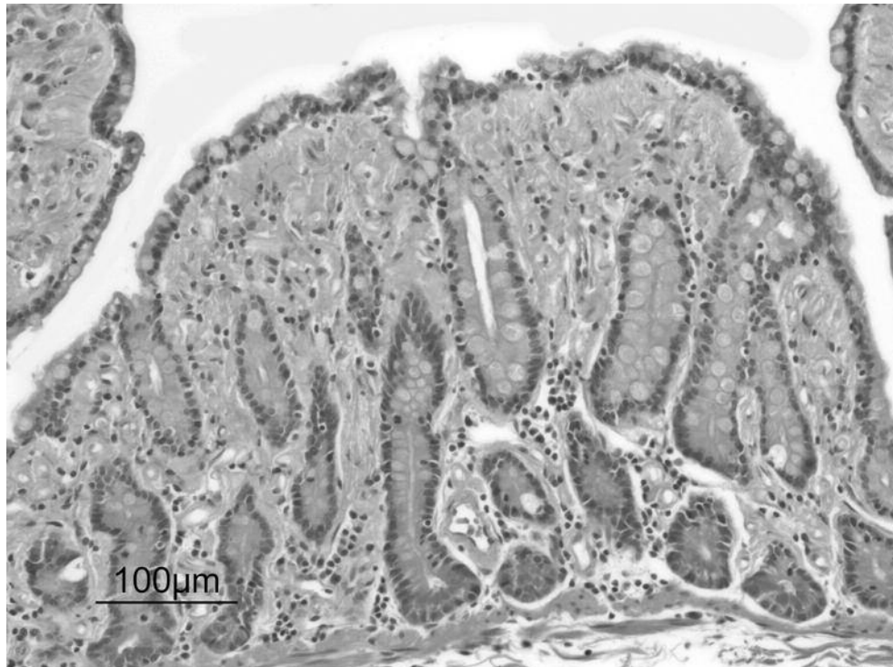
Figure 2. Detail to show the replacement of the colonic mucosa by interstitial deposits (H&E, \times 10 , baboon).

In conclusion, it is apparent that baboons with systemic amyloidosis at this facility are affected, not only in the liver, pancreas, spleen, kidney, intestines and mesenteric lymph node, but also in other organs of the GI tract such as the stomach (3, 14) and the colon (present report). However, the latter two organs are less susceptible to amyloid substance accretion than the former ones. The apparent natural resistance of the colon of baboons to being affected by systemic amyloidosis, a phenomenon also observed in other animals (1, 10-12), should be investigated further.