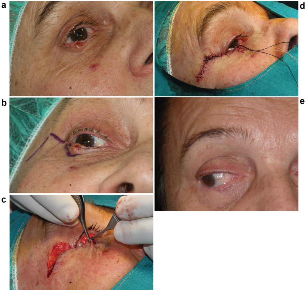
Figure 3. Tenzel reconstruction series: A: Eyelid tumor centrally located; B: incision lines are marked; C: flap advancement with suture of defect; D: final aspect; E: outcome at 3 years.

We were able to reconstruct the defect with the sole canthotomy in nine cases, where the loss of substance then allowed a tension-free closure, moving the mobile full-thickness eyelid flap created by the tendon branch division medially.