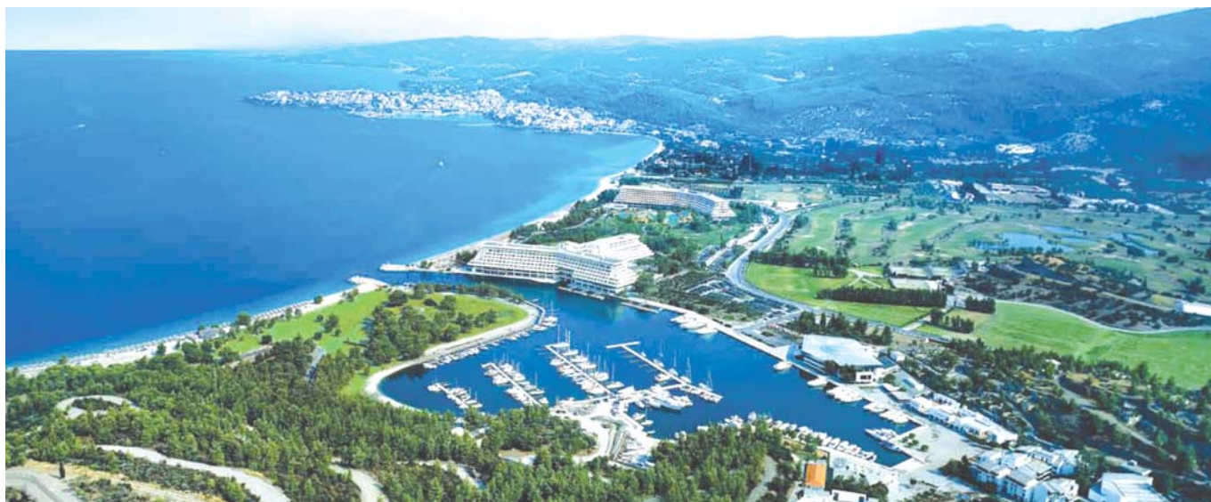
Porto Carras Grand Resort, Sithonia, Greece