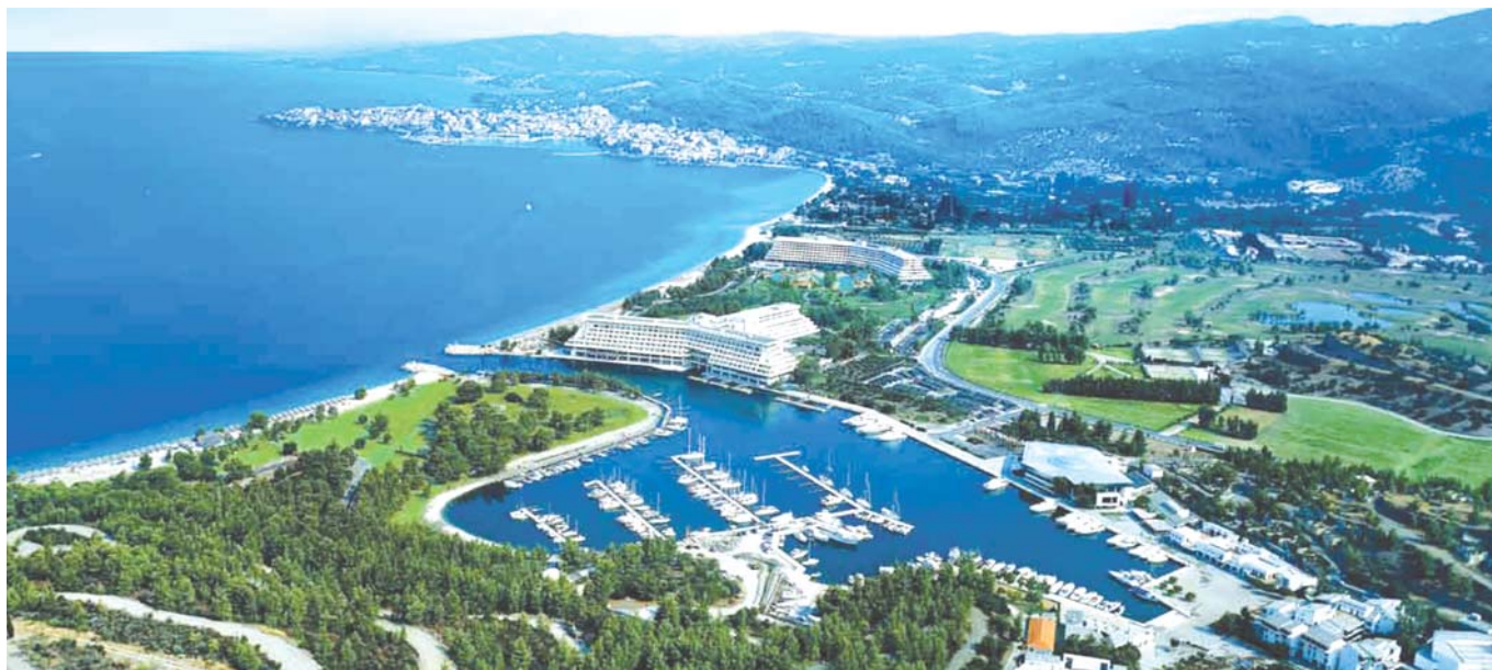
Porto Carras, Sithonia, Greece