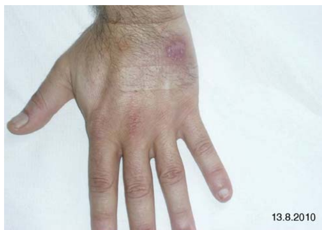
Figure 5. Re-epithelialization of the wound.

The importance of our case lies in the fact that the cases with associating HCL with leukemia cutis are very rare, but also due to the fact that after the excision of the skin lesion of the left hand, the surgeons chose to let the wound heal by secondary intention, although patients with leukemia do cicatrize more poorly than other patients because of the more frequent presence of the bacterial infection at the site of excision.