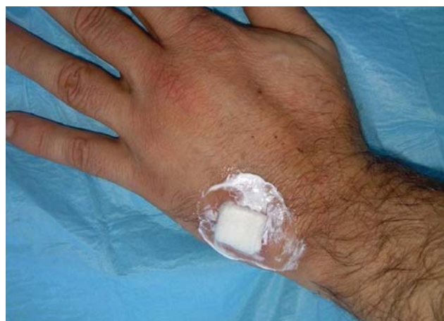
Figure 3. Advanced dressings (Promogran®) to total healing of the wound.