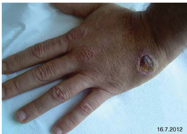
Figure 1. Purplish-brown skin nodule on the back of left hand, approximately 2 × 2 cm, with an erythematous halo, ulcerated surface and squamous crusts.