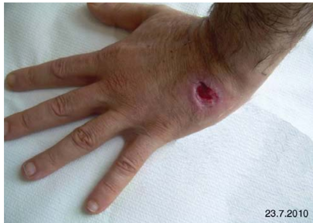
Figure 4. Wound during the process of re-epithelialization.

zoster, herpes simplex and in sites of intramuscular injections. However, these mechanisms are not the only ones to be involved in these skin lesions (3).